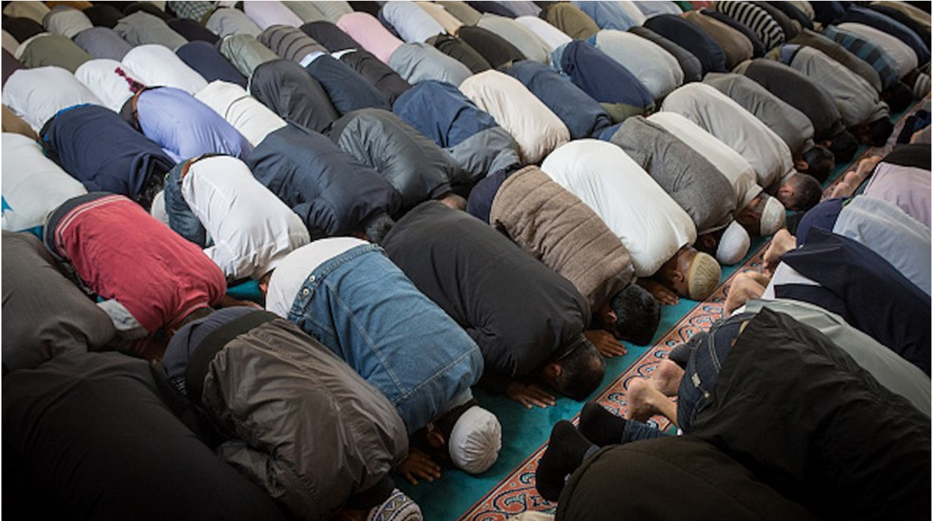
TOP: First Friday prayers of Ramadan at the East London Mosque in London, England.